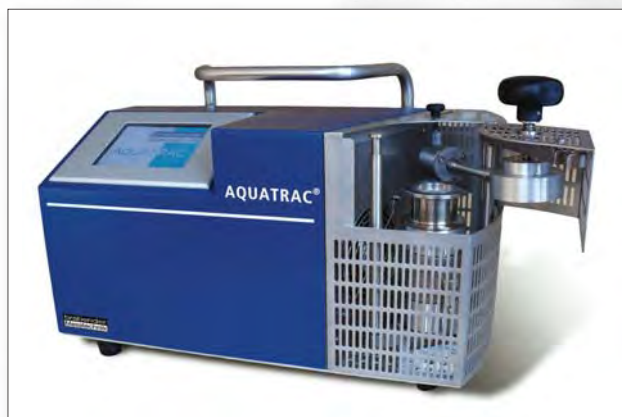
AQUATRAC®-3E with open reaction vessel

AQUATRAC® - 3E can be used independently of a computer or other peripheral.