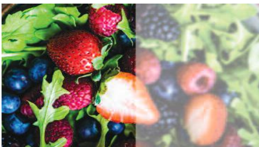
Viewed through material with low haze