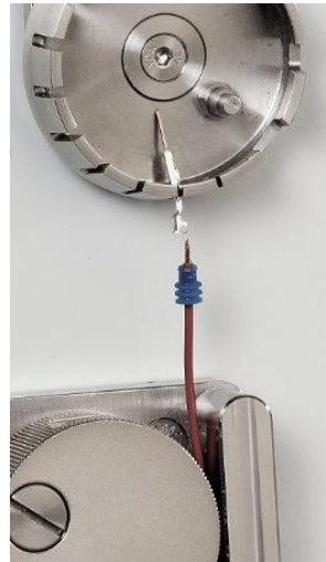
Clamping crown (standard)