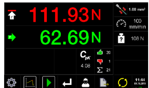
Measurement results on the touch screen