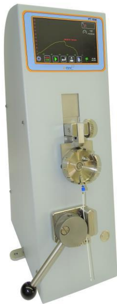
Pulltester PT 750

Testing device for the pull force measurement