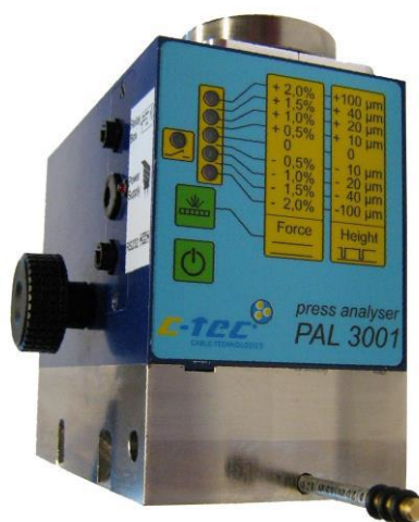
Press Analyser PAL3001

Press analysis tool for crimping presses