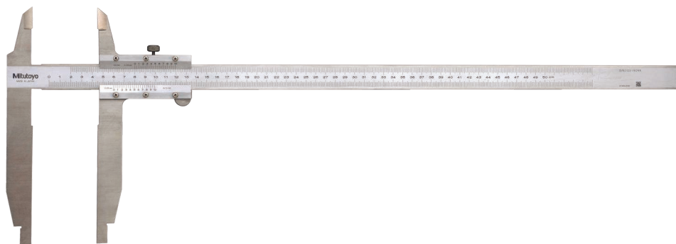
Without fine adjustment