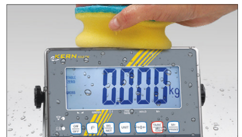
Stainless steel display device with IP67 protection, hygienic and easy to clean