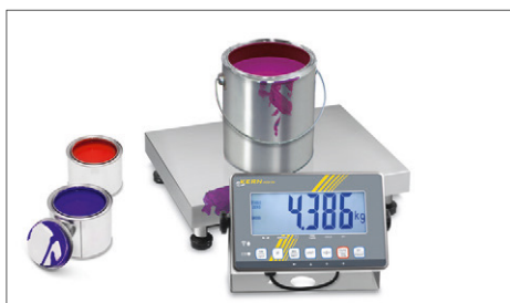
Durable stainless steel weighing plate